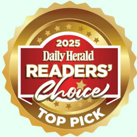
Public Golf Course